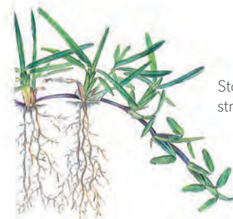
Stolon and leaf structure illustration.